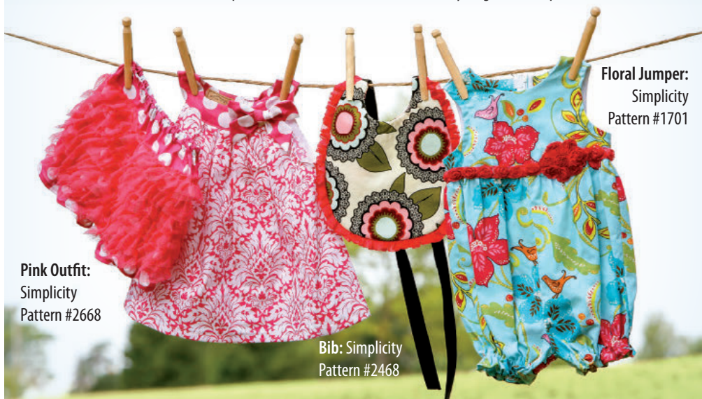
Pink Outfit: Simplicity Pattern #2668

These made-for-baby outfits embrace forward florals and damask-inspired patterns. And with the added trims, they've got a boutique look.