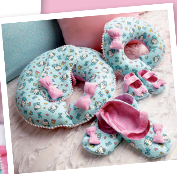
SHOES: SIMPLICITY PATTERN #2278

↑ MEOW MIX You don't have to be a kid to believe this famous kitty is the cat's meow. To join the craze, try slipping your paws into cozy flannel lounge shoes made with Simplicity Pattern #2278 or McCall's #4123 for the neck pillow.