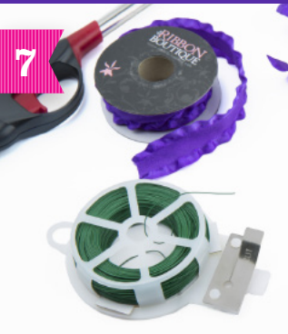
Tip: To prevent frayed edges, carefully singe ribbon ends with a lighter.