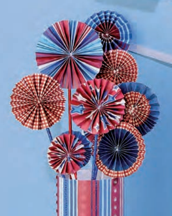
how to make a PAPER PINWHEEL