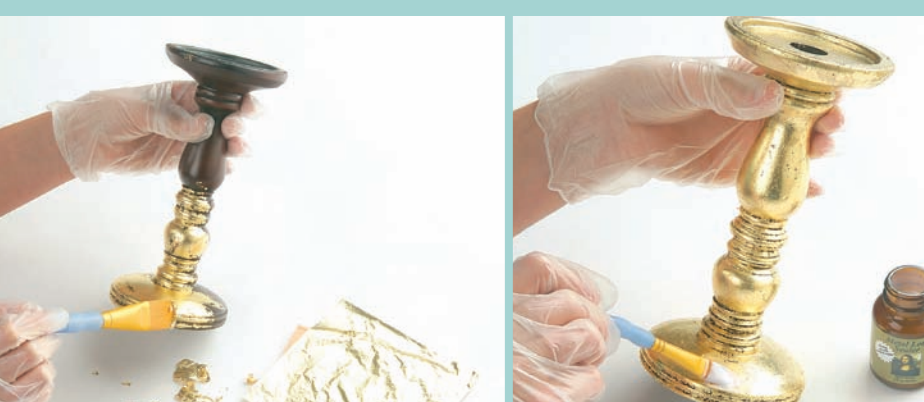
4. Continue to use the paintbrush to dust away excess leafing.

2. Use a paint brush to apply leafing adhesive