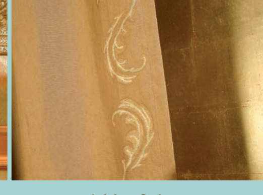
gold leaf drapes

Change a salvaged frame into an old world masterpiece in no time with gold leafing and metalic paints.