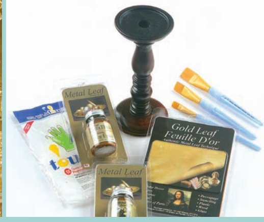
1. Supplies: Candlestick, Gold Leafing Leafing Adhesive, Leafing Sealer, Paint Brushes, Rubber Gloves