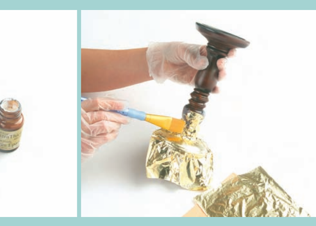
3. Place a sheet of leafing onto candlestick and use a dry paintbrush to lightly press the leafing into adhesive.