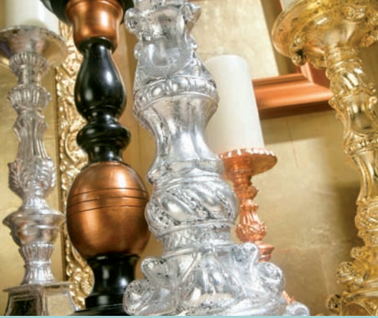
We turned plain Jane candlesticks glitzy and glamorous in just a few simple steps.