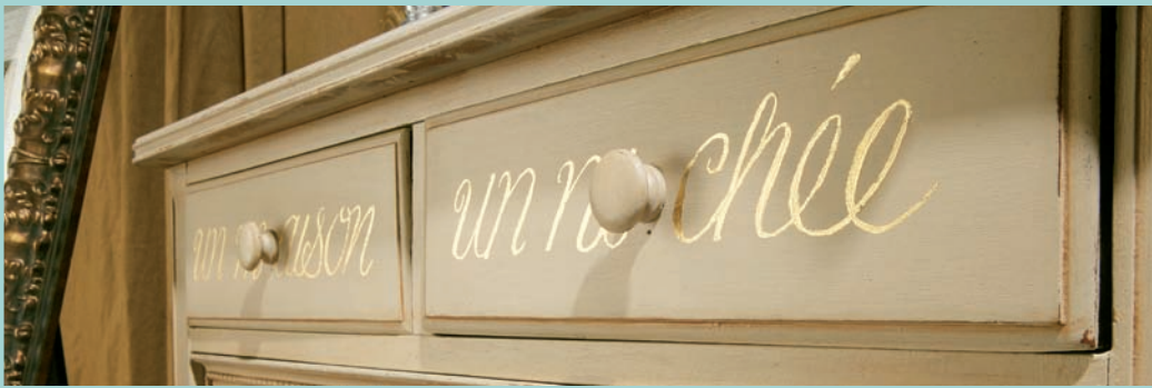
A House, A Nest, A Place to Rest! {Un Maison, Un Nichée, Une Place à Rester}

Turn ordinary curtains into stylish scrolled draperies. Simply stencil with liquid gold leaf paints to create fabulous details.