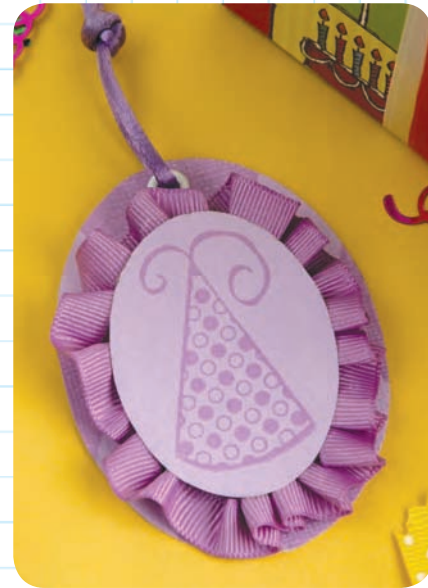
Playing Tag... When it comes to gifts, personal touches make all the difference. That's why these bright, whimsical gift tags should be the final flourish on anything you wrap. They're made using a variety of easy techniques. For example, the sunny cupcake tag features a stamped icon that was colored, cut out, and attached with foam adhesive. The purple party hat tag features a stamped image that was mounted on a fancy ribbon border. The ribbon was gathered by hand and secured to cardstock with double-sided adhesive.