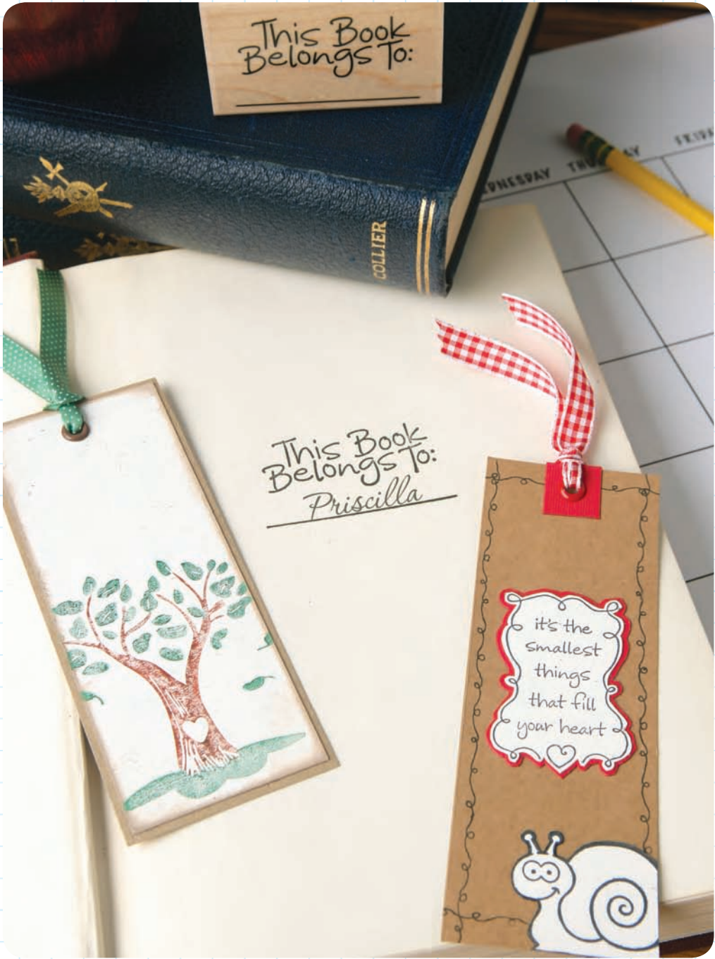
Hitting the Books... You're not exactly by the book, and your library shouldn't be either. Stock it with a collection of handmade bookmarks. They're created with rubber stamps; from quirky and sweet to eco-chic. Simply cut out and layer stamped quotes and images to make your own. But don't stop there, mark every book in your collection with a simple bookplate stamp. When the ink is dry, just fill in with your name!