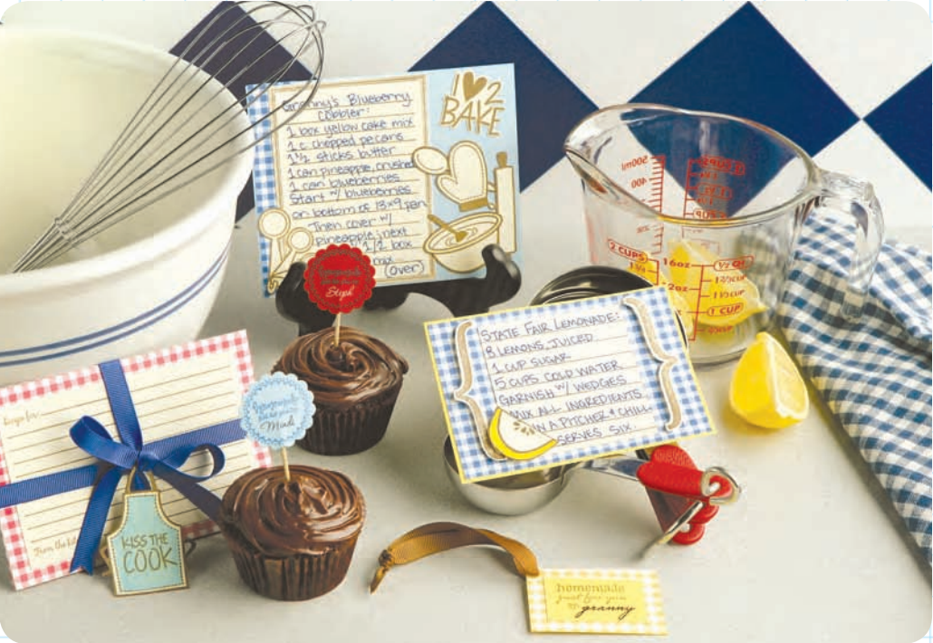
Sweet and Savory... First you stamp, and then you stir! Our handy rubber stamps are a big help in the kitchen. Start with a set of beautiful recipe cards—just stamp, color, and cut. Then, whip up a plateful of cutie-pie cupcake picks. They come together in no time with a label stamp and a scalloped circle punch. And what's the final ingredient? A selection of freshly stamped gift tags garnished with bright eyelets and sweet coordinating ribbon.