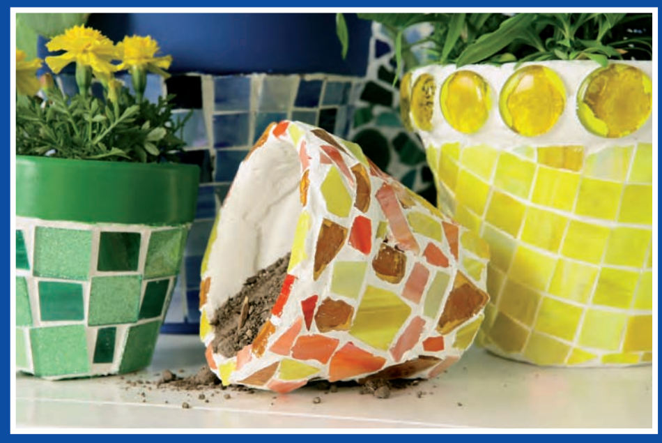
once upon a tile... these darling garden pots blend beauty and the art of mosaic perfectly. Using a mix of our versatile, pre-cut tiles (available in glass and ceramic) it's easy to play up the color in your designs. Keep things solid, or mix up colors and finishes for a custom look. Tip: We suggest sealing the grout if pots are to be used as outdoor planters.

one man's trash... once a ho-hum wooden trashcan—now custom décor! This sunny project began with a simple coat of yellow paint. We then added a stunning mosaic design to the front panel. See "Picture Perfect" below, on how we did it!