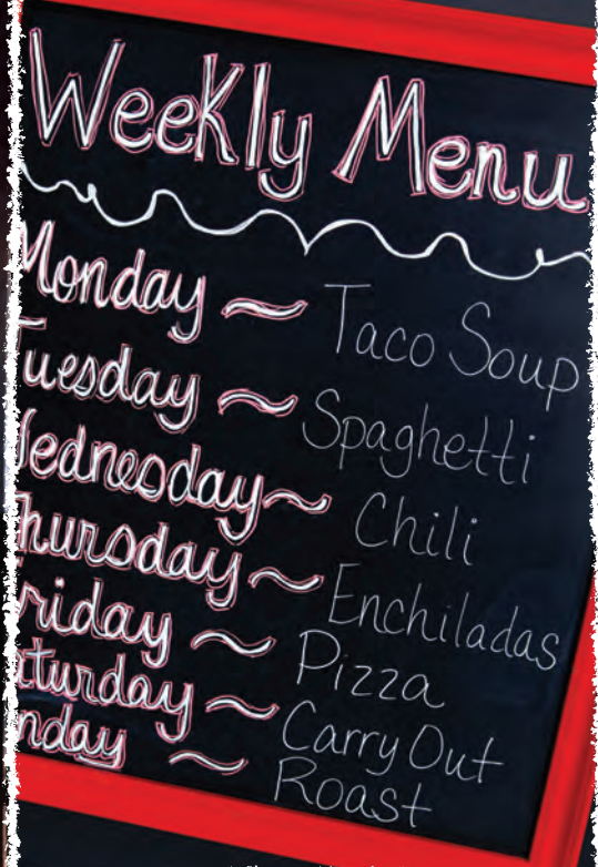
Weekly Menu Monday ~ Taco Soup Tuesday ~ Spaghetti Wednesday ~ Chili Thursday ~ Enchiladas Friday ~ Pizza Saturday ~ Carry Out Sunday ~ Roast