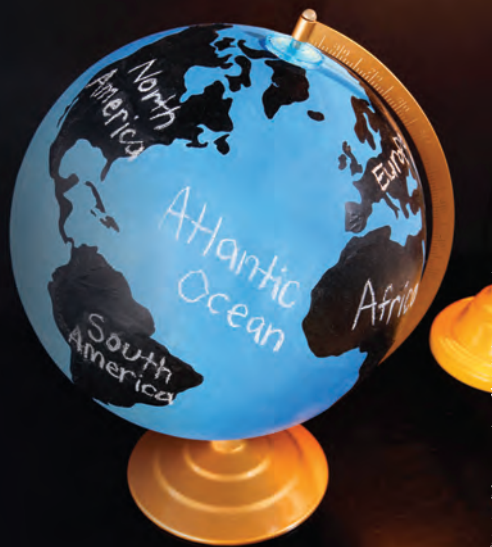
TOP OF THE WORLD... Thanks to our new blue paint, we turned a secondhand globe into a learning tool by painting on a chalkboard map. Your little one can label the oceans and countries, erase the marks and label them again!