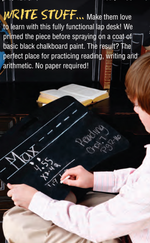
WRITE STUFF... Make them love to learn with this fully functional lap desk! We primed the piece before spraying on a coat of basic black chalkboard paint. The result? The perfect place for practicing reading, writing and arithmetic. No paper required!