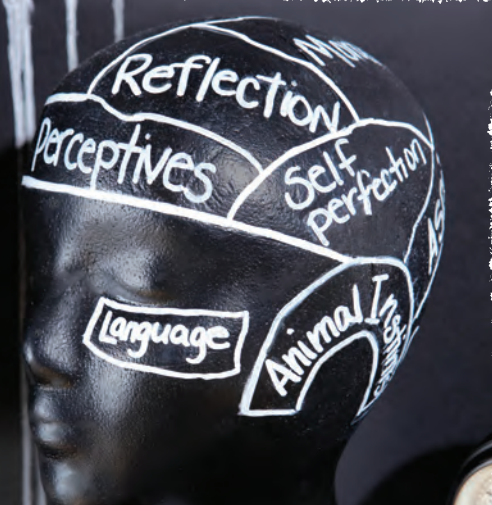
HEAD CASE... Divine décor? In this case, it's all in the head! Chalkboard paint is a fun way to freshen up found objects, hand-me-downs, thrift store finds, and in this case, a Styrofoam™ head (available in the Craft Department)! Simply prime, paint and allow to cure (according to the manufacturer's directions). Then, break out the chalk to create your design.