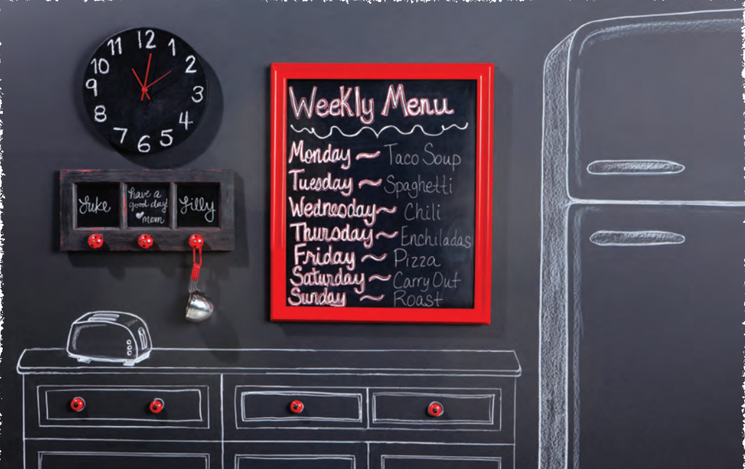
Weekly Menu Monday ~ Taco Soup Tuesday ~ Spaghetti Wednesday ~ Chili Thursday ~ Enchiladas Friday ~ Pizza Saturday ~ Carry Out Sunday ~ Roast