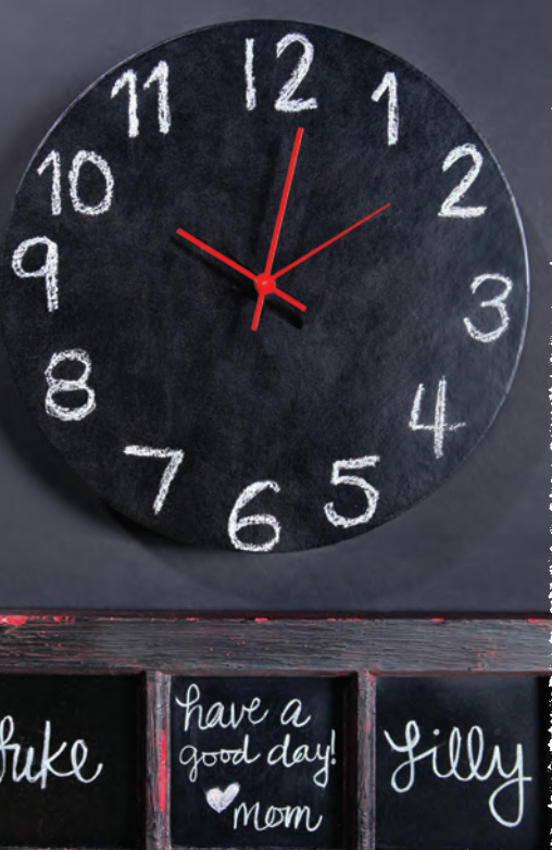
have a good day! mom Duke Gilly