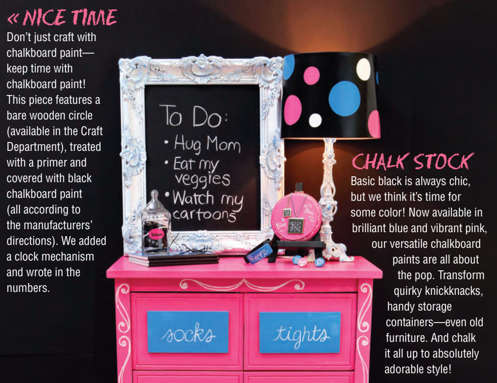
« NICE TIME Don't just craft with chalkboard paint—keep time with chalkboard paint! This piece features a bare wooden circle (available in the Craft Department), treated with a primer and covered with black chalkboard paint (all according to the manufacturers' directions). We added a clock mechanism and wrote in the numbers. CHALK STOCK Basic black is always chic, but we think it's time for some color! Now available in brilliant blue and vibrant pink, our versatile chalkboard paints are all about the pop. Transform quirky knickknacks, handy storage containers—even old furniture. And chalk it all up to absolutely adorable style!