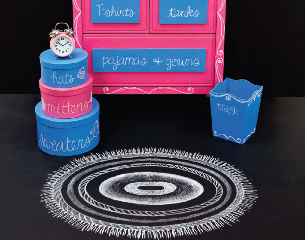
hats mittens sweaters trash