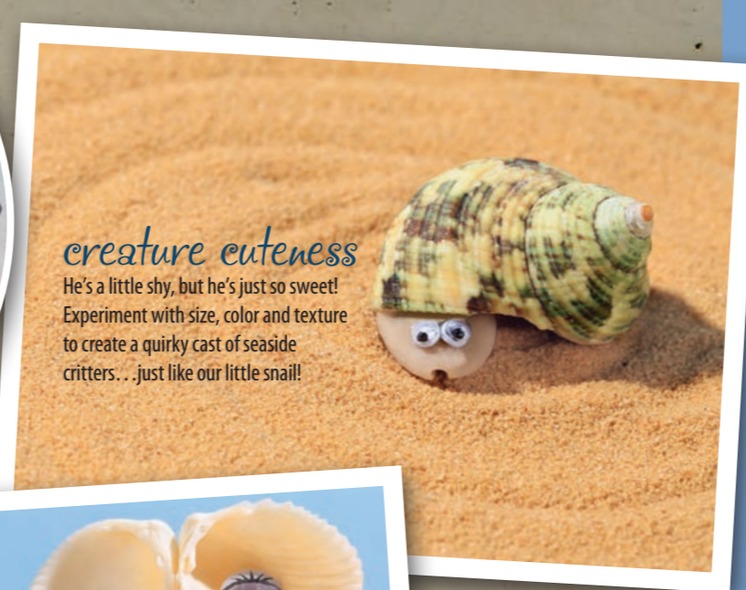
creature cuteness He's a little shy, but he's just so sweet! Experiment with size, color and texture to create a quirky cast of seaside critters... just like our little snail!