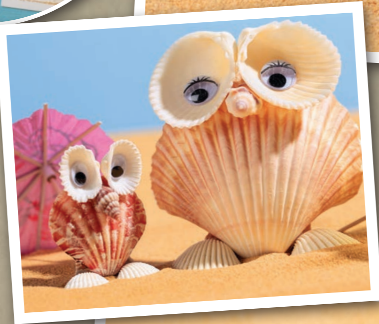
« darling double Clamming up has never looked better! This look gets plenty of laughs with strategically placed shells, wiggly eyes and hot glue!