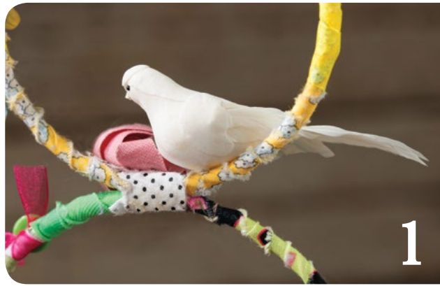
just dovey (1-2) What dove wouldn't love to be a part of your handmade décor? This one looks especially sweet on our fabric-wrapped rings. He's the perfect companion for a handmade fabric rosette.