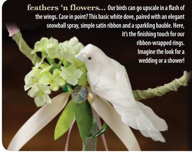
feathers 'n flowers... Our birds can go upscale in a flash of the wings. Case in point? This basic white dove, paired with an elegant snowball spray, simple satin ribbon and a sparkling bauble. Here, it's the finishing touch for our ribbon-wrapped rings. Imagine the look for a wedding or a shower!