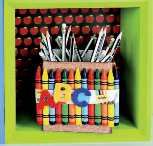
Fun and easy gifts to show your favorite teacher just how much you appreciate them!