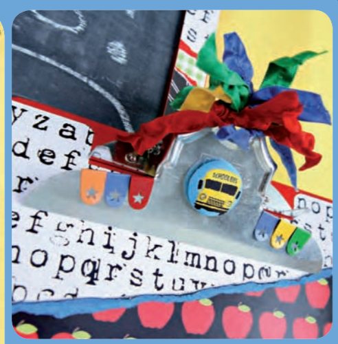
teacher tools From bland to brilliant! From the cutie-pie clipboard, to the cheery miniature chalkboard, to the festive apple with caterpillar pointer, to the over-the-top card holder tin—every piece says “thank you teacher!”