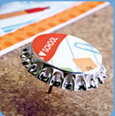
What would we do without teachers? They show us the ropes when we're tackling our ABC's & 123's. They guide us through years of papers and projects and practices—all to prepare us for the future. So, why not show them how much they really mean to us with a classroom full of handmade gifts from the heart!