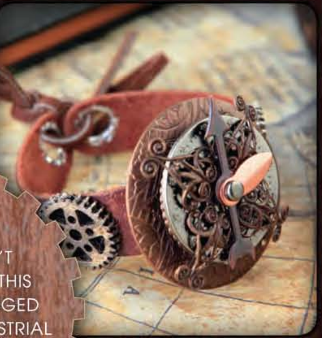
⌘ clock thought Time travel... changing times... time gone by. This watch-style piece combines jewelry and scrapbooking components on a chic leather band.

ATTENTION GENTLEMEN! STEAMPUNK ISN'T JUST FOR LADIES! THIS TREND—THINK RUGGED LEATHERS AND INDUSTRIAL EMBELLISHMENTS—LEND ITSELF TO A MASCULINE POINT OF VIEW!