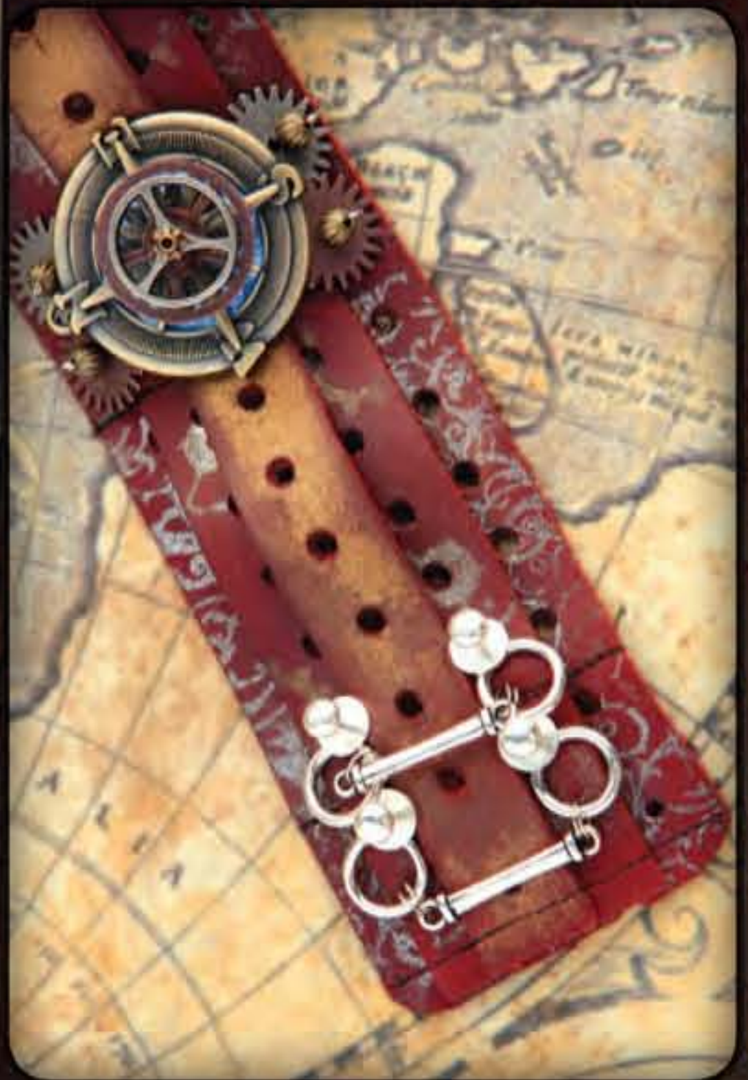
» comely compass Go heavy on the leather for ruggedly romantic steampunk appeal. This piece features leather bands altered with embossing ink, then machine-stitched together.