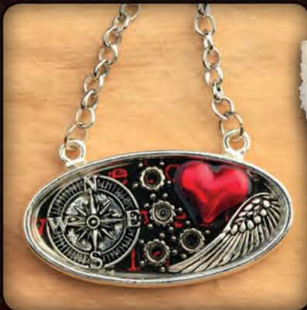
⌘ bygone bezel This steampunk collage features printed paper and vintage-style charms, all artfully arranged under clear resin.

Steam-punk (n): A design aesthetic that focuses on a fusion of modern technology, steam-powered machinery and Victorian romance. Strongly influenced by the writings of Jules Verne, H.G. Wells and Mary Shelley.