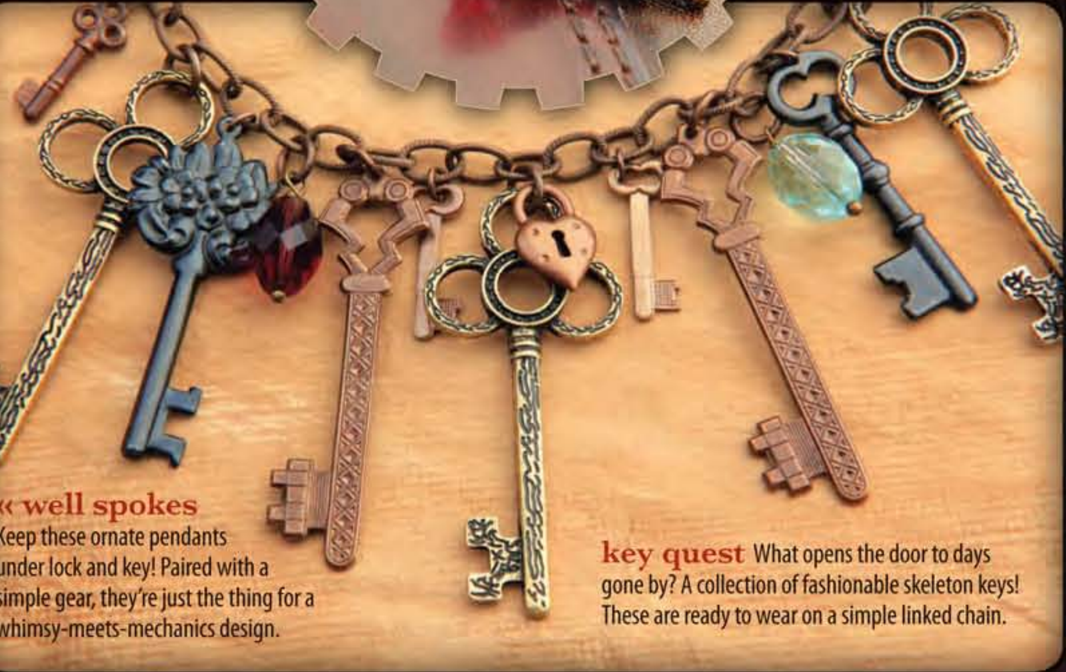
« well spokes Keep these ornate pendants under lock and key! Paired with a simple gear, they're just the thing for a whimsy-meets-mechanics design.