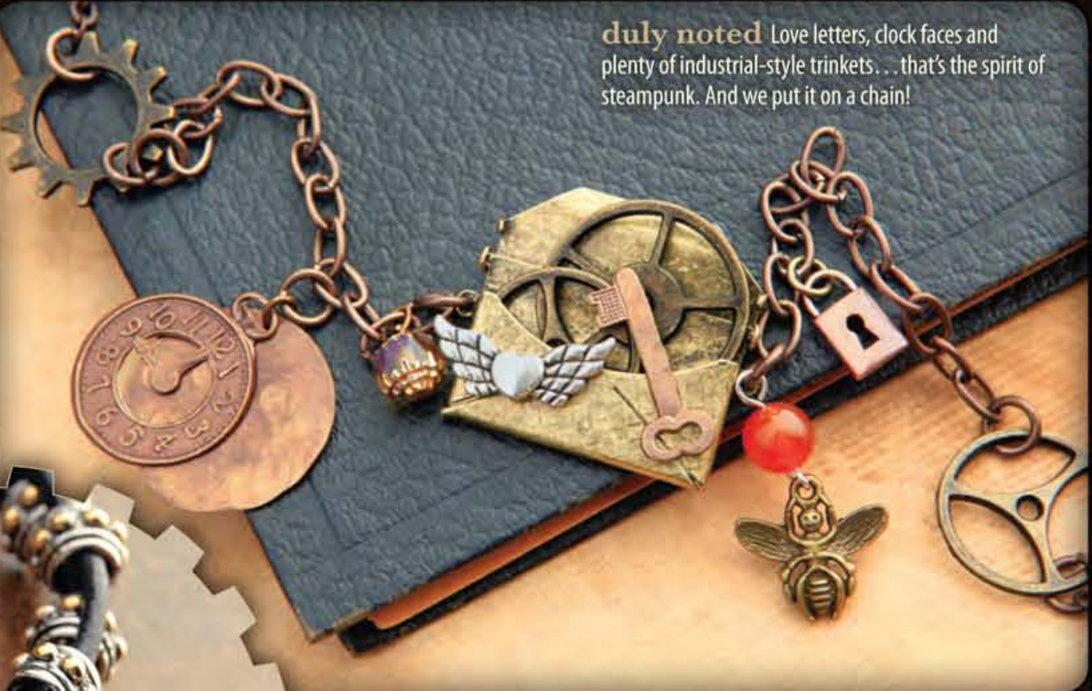
duly noted Love letters, clock faces and plenty of industrial-style trinkets... that's the spirit of steampunk. And we put it on a chain!